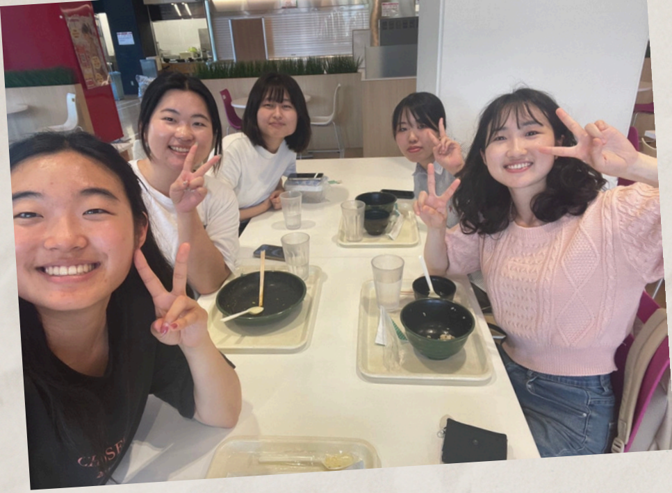
fully bellies, empty bowls...