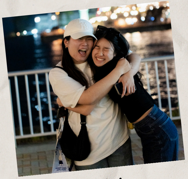
jubeen + me <3