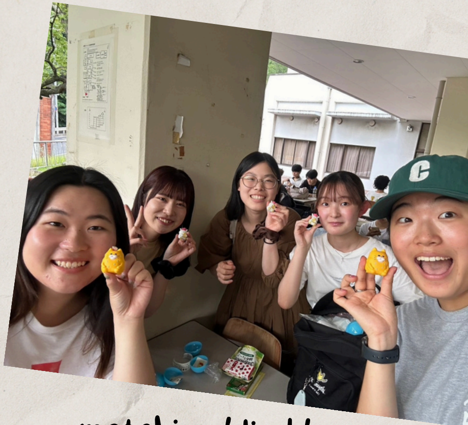
matching blind box figurines, so presh!!