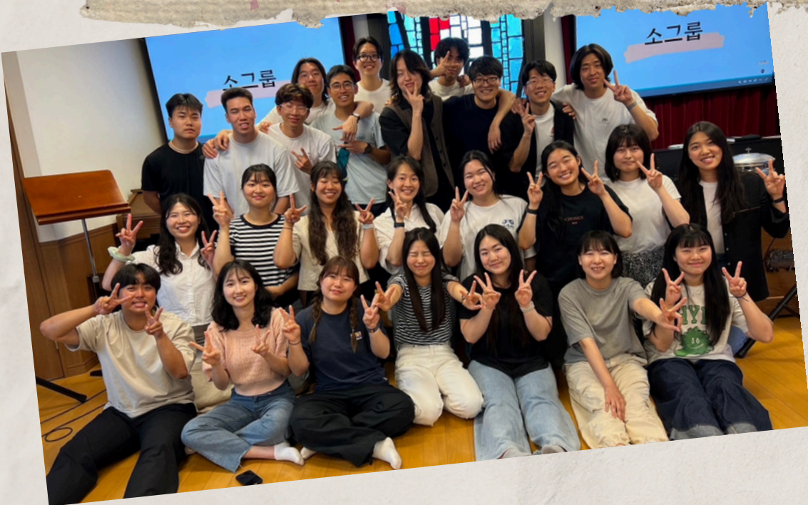
STINTers, what a blessing to meet & work with them!

Our God is such a good and faithful God! Not only did He answer my prayers, showing me how good the gospel has been for my own life, He also molded my heart to care for the lost. He taught me what it meant to truly care about the salvation of another being.