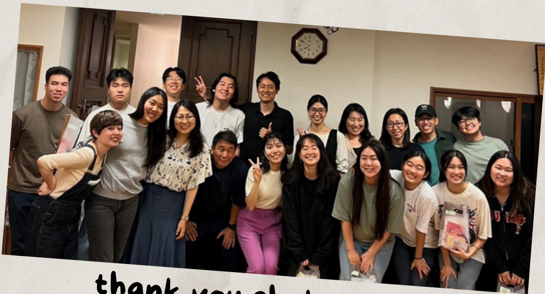
thank you shukugawa bible church for pouring SOOO much love onto our team