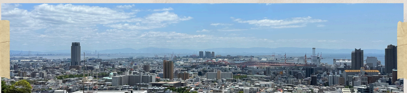
the view from my favorite spot at Kobe University :)

The first two weeks in Kobe were rough! Spiritually, Japan is extremely dead. Religion is not something that is brought up in conversations nor is it something most people think about for themselves. Because of the culture, our mission team rarely shared the gospel when first meeting friends. Many people on my team had expressed their frustration with not being able to share the gospel immediately. However, I didn't share the same heart as them. I realized that I didn't feel an urgency to share the gospel as I didn't know how to desire salvation for another person. After coming to this hard-swallowing conclusion, I felt an immense amount of guilt every time I met a new friend.