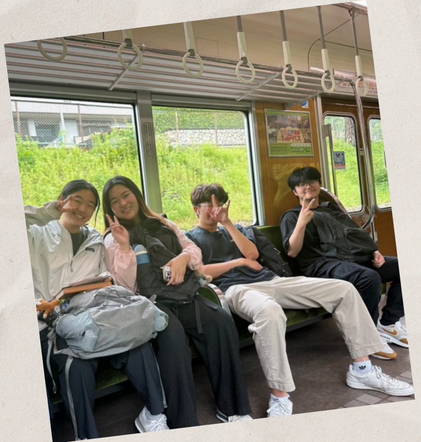
we ❤️ the subway